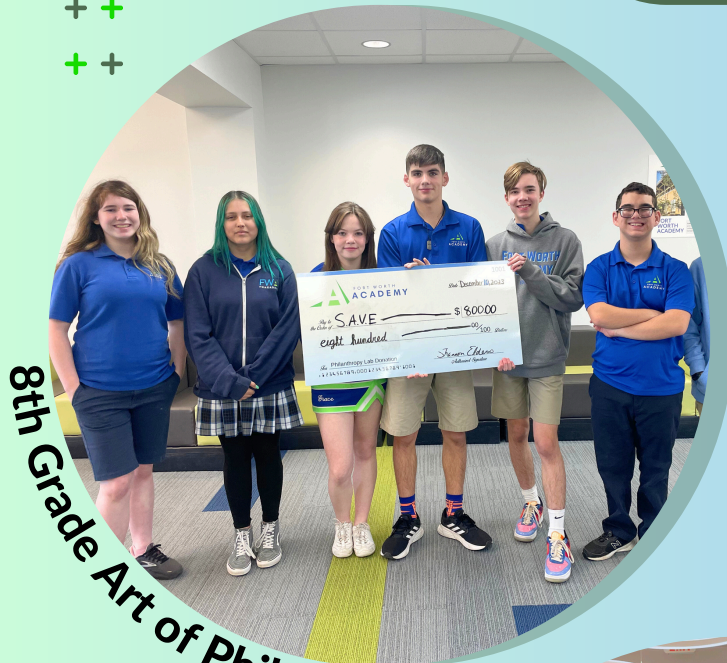
8th Grade Art of Philanthropy