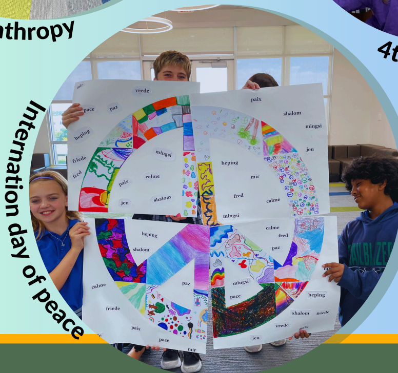
International day of peace