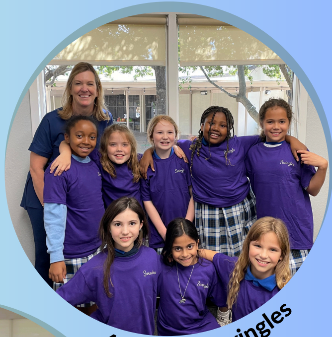
4th Grade Swingles