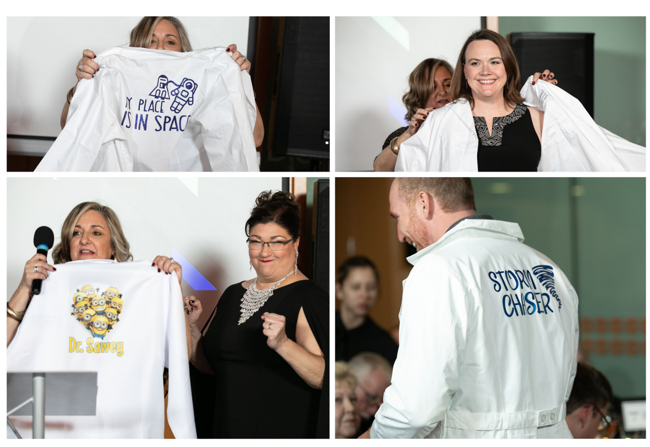
"Mad About Science"